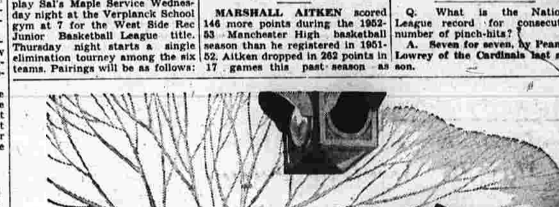
MANCHESTER TRUST will play St. Mary's Service Wednesday night at the Verplanck School gym...