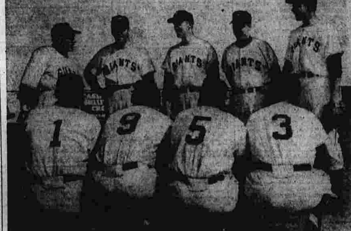
Manager Leo Duracher, left, tells his Giants this is the year, and from the looks of things they think that's no longer an active...