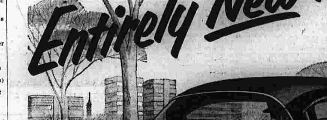
The shining new Oldsmobile Sport Coupe, one of 16 beautiful models in 3 great new series.